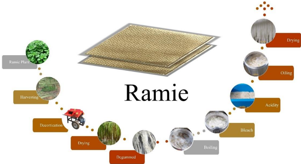
Figure 2. Extraction process of ramie fibre.

process guarantees that the moisture from the retting process does not affect the natural characteristics of ramie fibres which can be further utilized for backgrounds of various textile and industrial applications.